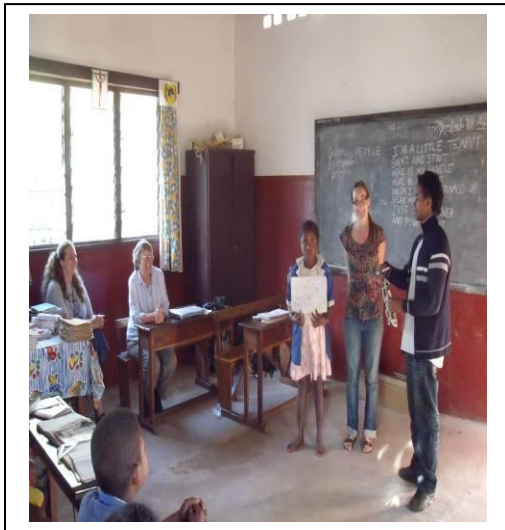
Working at school as in the forest

In addition to working with someone else, the field assistant usually wants to do their own research, eventually with assistants of their own. In that case, I encourage the Malagasy student to work in the field as an assistant. If you want to be a good researcher you have to begin your work as field assistant.